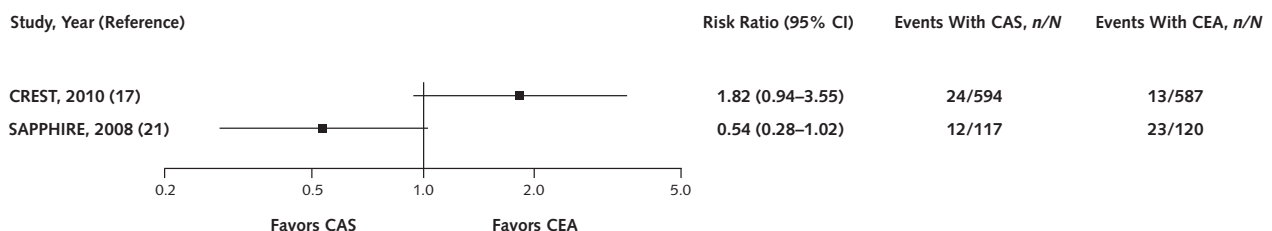
Figure 1. Forest plot of ipsilateral stroke (including any stroke within 30 days) in RCTs of CAS versus CEA.

CAS = carotid artery stenting; CEA = carotid endarterectomy; CREST = Carotid Revascularization Endarterectomy Versus Stenting Trial; RCT = randomized, controlled trial; SAPHIRE = Stenting and Angioplasty With Protection in Patients at High Risk for Endarterectomy.