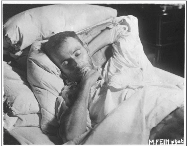
"Death Bed" Photograph of Renowned Viennese Painter Egon Schiele (1890–1918).

future influenza viruses cannot be predicted from the nearly infinite number of possibilities, developing a truly protective universal vaccine